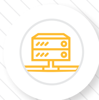
Artificial Intelligence and Big Data