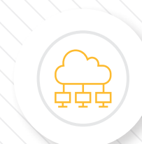
Industrial Internet of Things