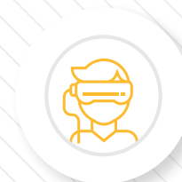
Modeling, Simulation and Visualization